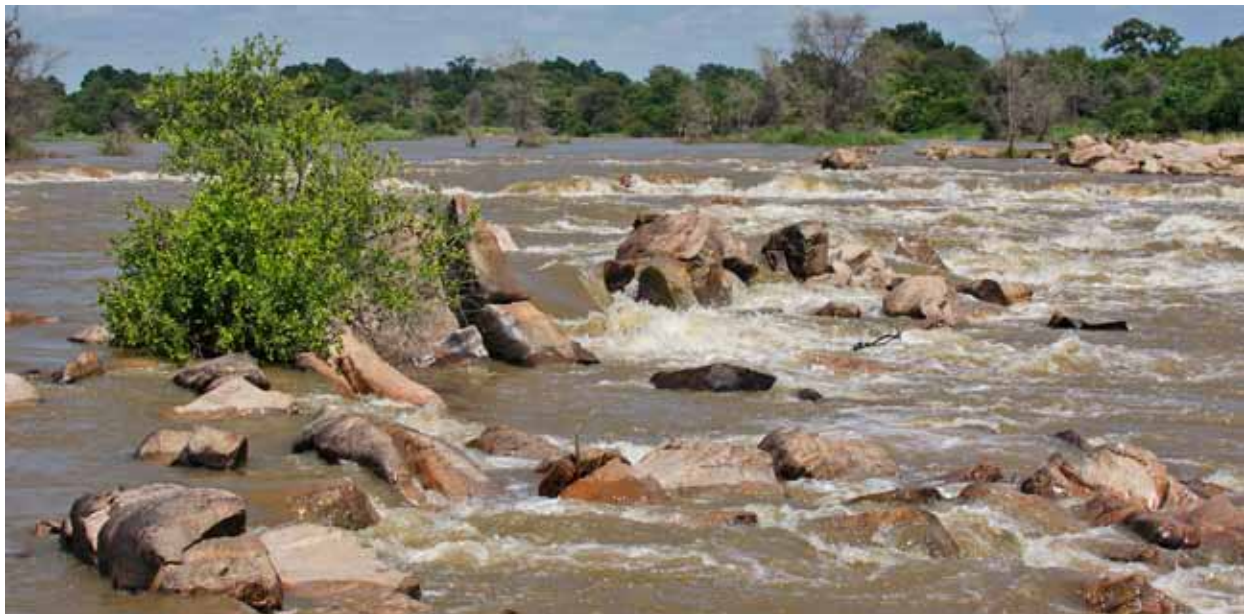
Rocky outcrops at 'Raaswater'