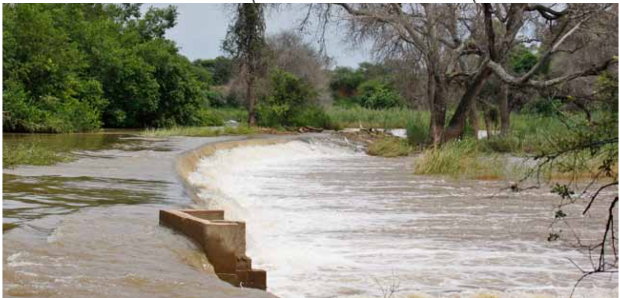
At the "Bridge" crossing the Limpopo River