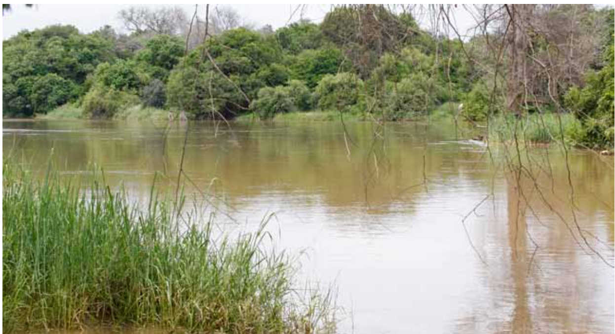
Limpopo River upstream from 'Raaswater'